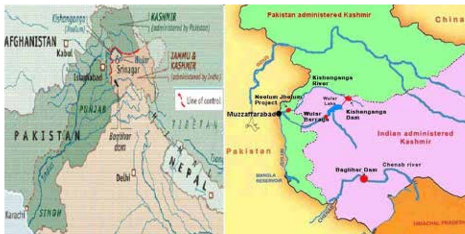
Fig. 2. Rivers flowing into Pakistan and the location of Indian hydropower projects.

The famous Indus Water Treaty which was hampered between the two countries in 1960 clearly defines the shares of water resources for both the countries, assigning their rights and obligations in this regard. Three western rivers (Indus, Jhelum and Chenab) were given to Pakistan while the three rivers (Ravi, Beas and Sutlej) on eastern side to India. Both the countries were given unrestricted use of the above mentioned rivers. They were put under an obligation not to stop or interfere with the flow of water in their respective rivers except for domestic and non-consumptive use. However, India was allowed limited use of western rivers for irrigation purposes. India is not only making full use of its allocated share but has also started ambitious projects like Kishenganga, Baglihar and Wular barrage on the western rivers on one pretext or the other like provision of cheap electricity to the people of Jammu and Kashmir, limited use of water for hydroelectric projects as envisaged in the treaty. The construction of these dams has serious reverberations for Pakistan in future, some of which have already been witnessed by us in recent past. The location of these structures is shown in Fig. 2 [7].